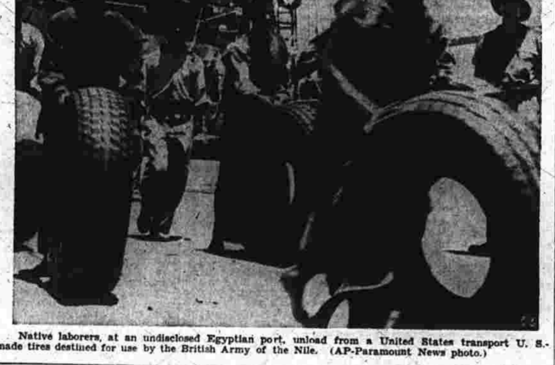
Native laborers, at an undisclosed Egyptian port, unload from a United States transport U. S. made tires destined for use by the British Army of the Nile.